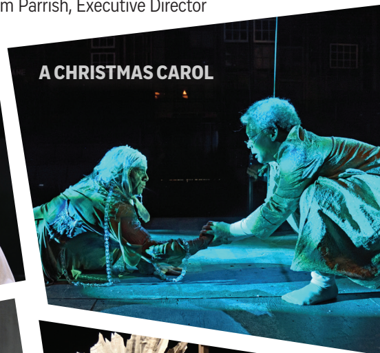
A CHRISTMAS CAROL