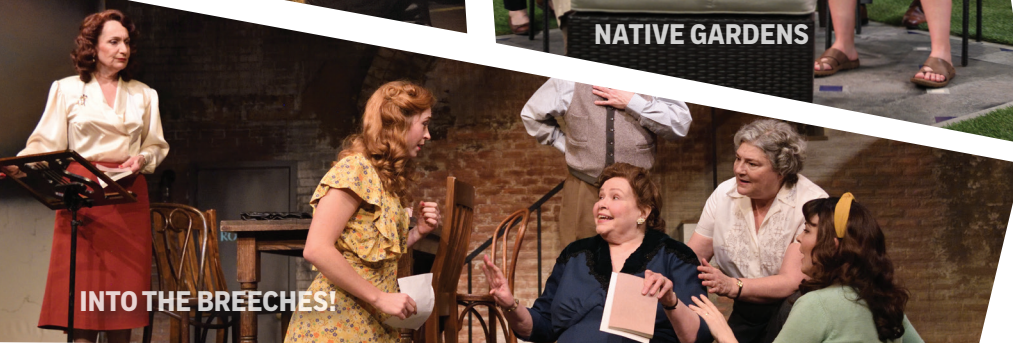
INTO THE BREECHES!