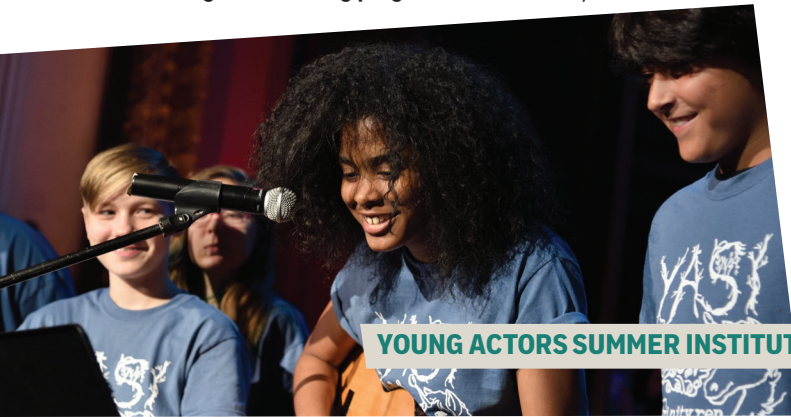
YOUNG ACTORS SUMMER INSTITUTE (YASI)