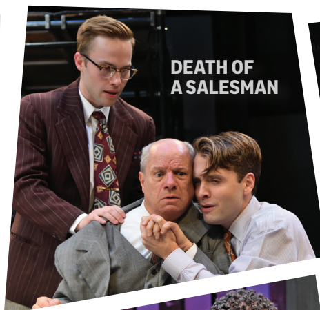
DEATH OF A SALESMAN