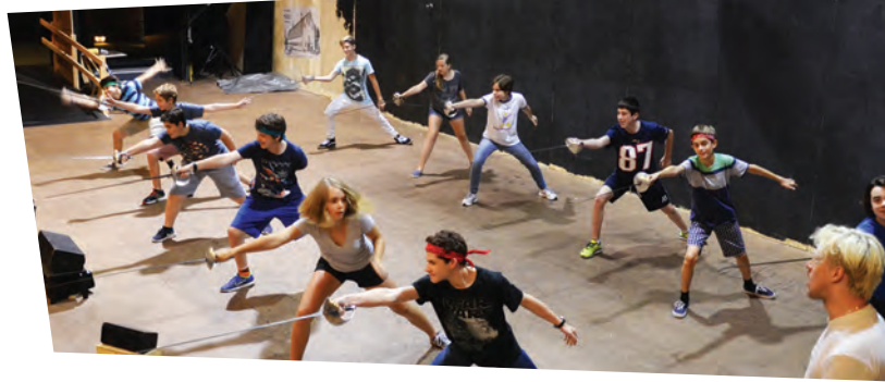
Stage combat lessons during Trinity Rep's Young Actors Summer Institute